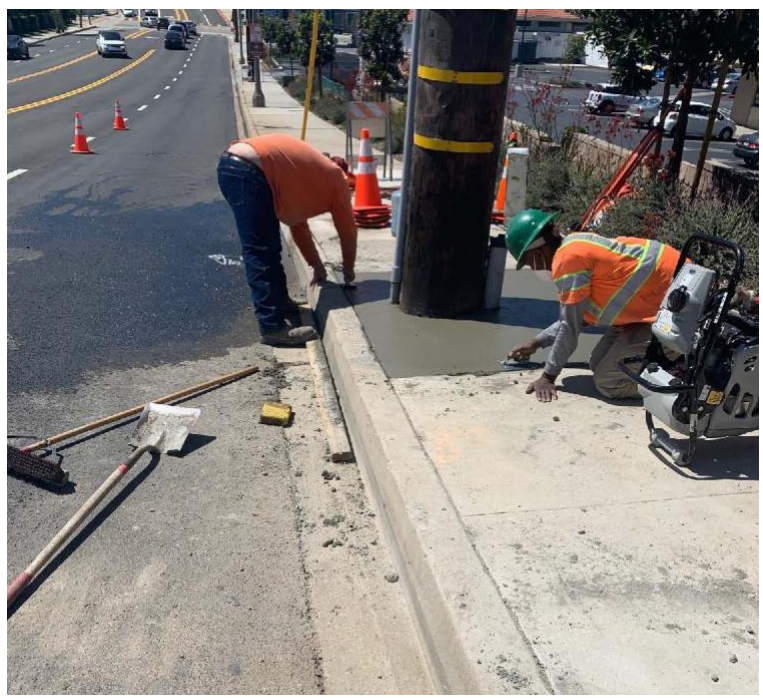
Construction crews working at SBFN connection site

ADF and its sub-contractors, HP Communications and Race Communications, continue their efforts to complete work orders that connect the remaining SBFN sites.